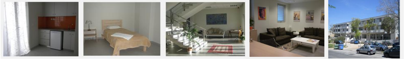
Views from Multicenter "Athena"

Please attach a photograph of your YWCA, projects or activities that you would like to share.