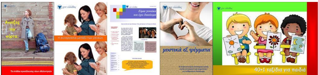
The Pan-Hellenic programmes for the training of volunteers (distance learning tool kits)