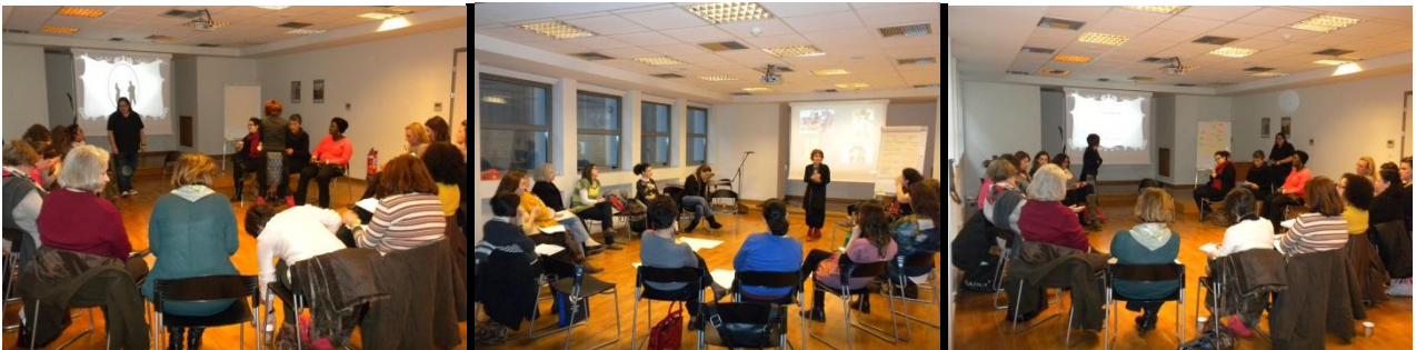
Experiential Workshop on Gender Issues & Sexual and Reproductive Health and Rights (2014)